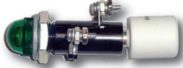
ET-16 indicating lamp

The ET-16 (Incandescent) and ET-17 (Neon) indicating lamps are designed for application on switch-board panels up to and including 0.25 inch thickness. The lamps economize on space and permit easy replacement of bulb and resistor.