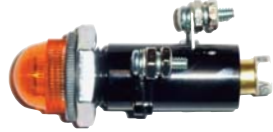
ET-17 indicating lamp