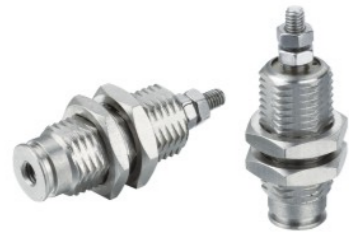
CJPB 10 x 15