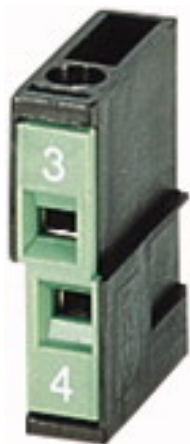
Screw adapter, for contact element 1N/0, RMQ16

Part no. SRA10 Catalog No. 028100 Alternate Catalog No. SRA10