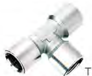
Equal Female Tee