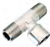
Male To Female Tee