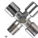
Equal Female To Male Cross