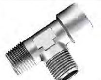
Double Male to Female