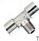
Male Stud Branch Tee