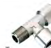
Male Run Tee