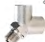
Female to Male Y