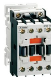
Power contactor BF09